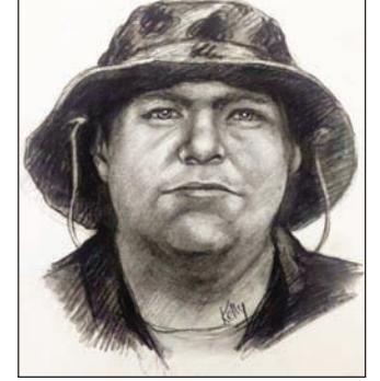
A 2014 GBI sketch of the Blairsville CVS armed robbery suspect.

"Milford was also identified by the GBI as the person responsible for