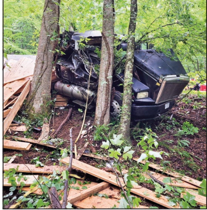
Miraculously, none of the three passengers - including two children - were seriously injured in this semitrailer accident last week.

The truck traveled off the right side of the road and struck several trees on its side, after which the truck "continued north off the right side of the road down an embankment"