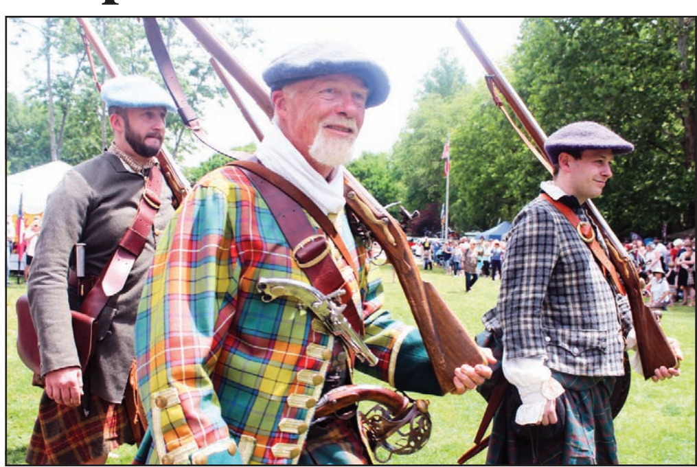
Clann Nan Con reenactors displayed traditional Scottish garb and weaponry to the delight of thousands at the Blairsville Scottish Festival over the weekend.