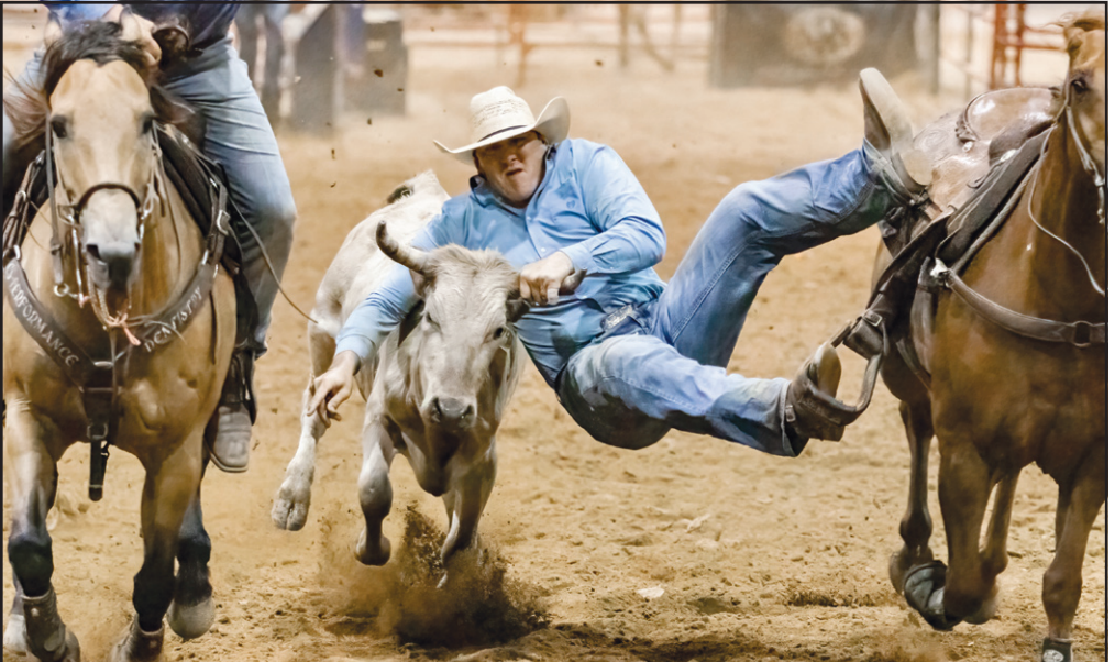
Steer wrestling is just one of many fan-favorite activities that will be on display at the traditional American pastime – the Blairsville Pro Rodeo – June 17 and 18 at the Union County Horse Arena.