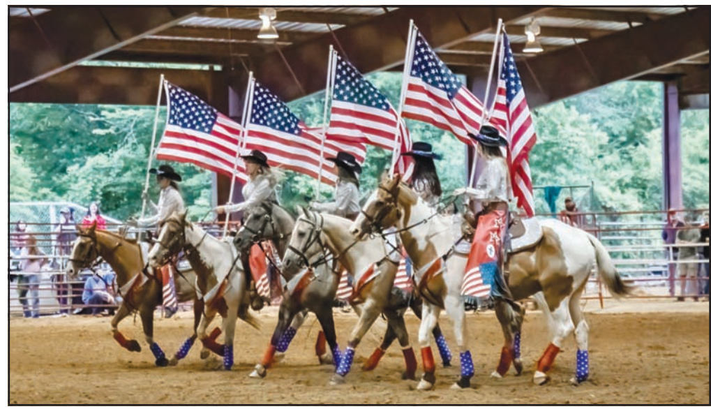
The Union County Sass 'n Saddle Precision Drill Team will be performing at the Blairsville Pro Rodeo this weekend.