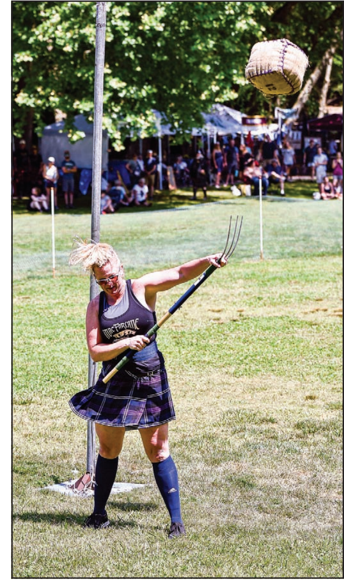
The sheaf toss is a popular Highland Games event, with both men and women competing over the two-day event at Meeks Photo by Todd Forrest Park.