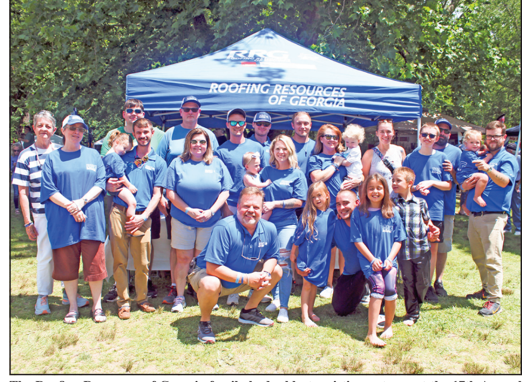
The Roofing Resources of Georgia family had a blast assisting patrons at the 17th Annual Blairsville Scottish Festival. RRG Roofing & Gutters was the 'Chieftain Sponsor," that is, the largest donor, for the weekend festivities.

For complete information and photos of last year's rodeo action, visit the official website at ww.BlairsvilleProRodeo. com or on Facebook. See ya there!